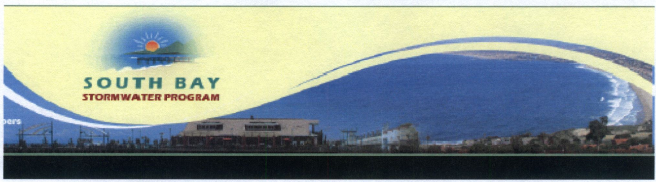
Santa Monica Bay Beach Bacteria Total Maximum Daily Load Jurisdictional Groups 5 & 6El SegundoManhattan BeachHermosa BeachRedondo BeachTorrance